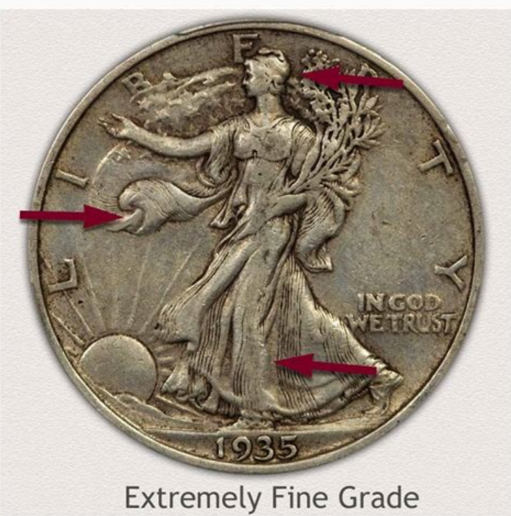
Extremely Fine Grade